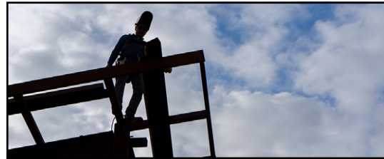
SETEX Construction Corp. makes headway on Eagles’ Nest for Student Success with roof deck installation.