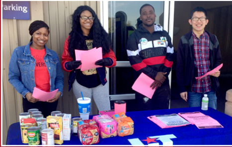
Public Speaking students gather donations for employees hurt by the government shutdown.