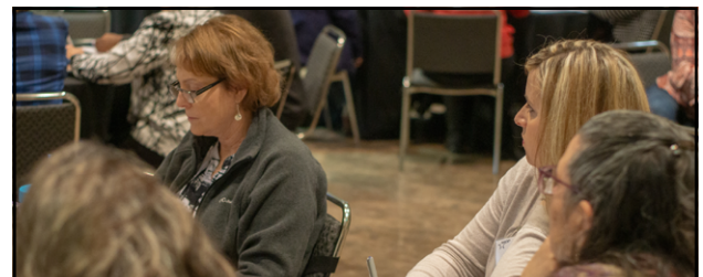
Educators from across the region, including LIT faculty, attend the NISOD regional workshop.