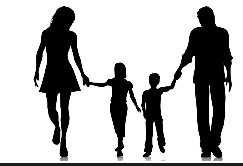
Flexible Spending Accounts: Health Care and Dependent Care