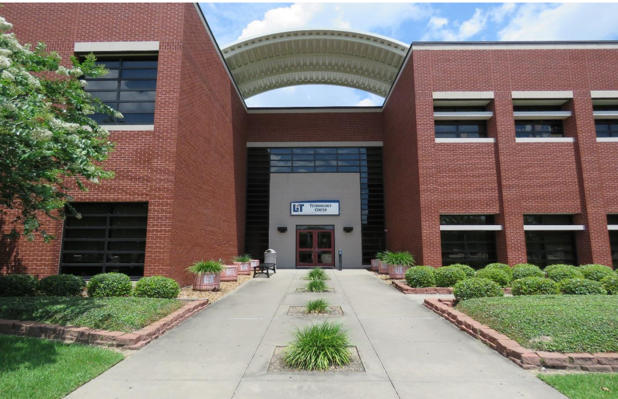
Lamar Institute of Technology - Technology Center