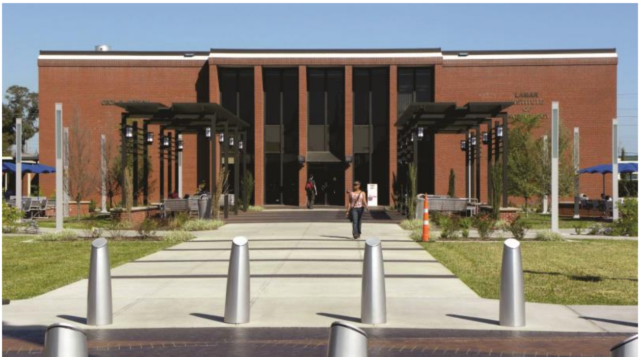
Lamar Institute of Technology Cecil Beeson Building