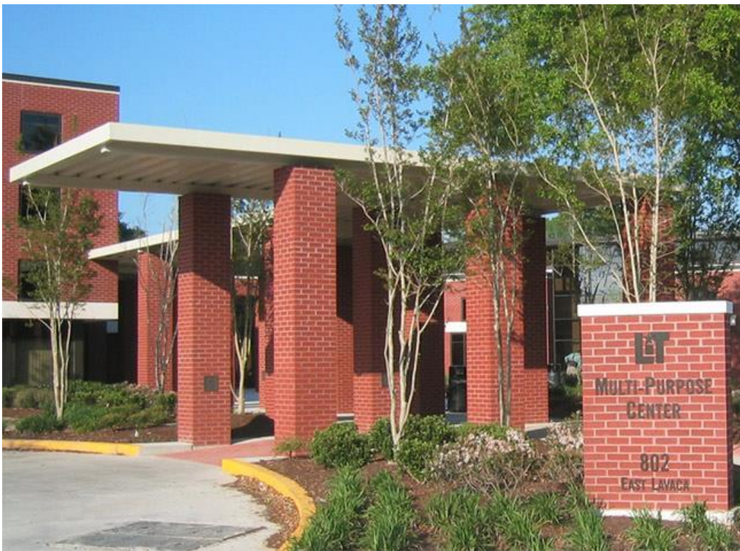
Lamar Institute of Technology Multi-Purpose Center