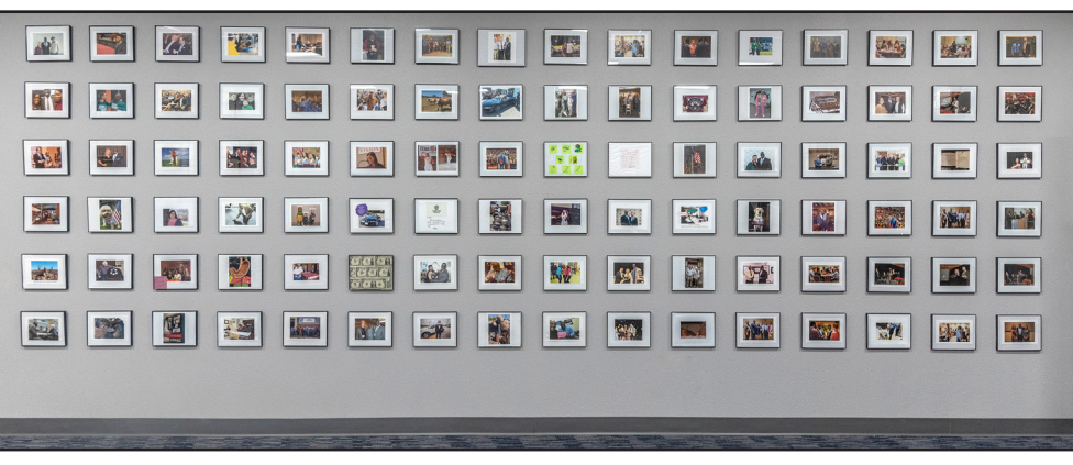
If you would like your pics placed on the President's Wall send selfies, cute pet moments and photos from your unique vacations.

Since childhood he was an avid collector of watches, clocks, radios, bottles, frog replicas, model trains, cars and airplanes, and fossils. He amassed over 500 clocks in his lifetime, and also donated many of his collection pieces to Beaumont area attractions and museums.