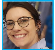
TDHA award winner