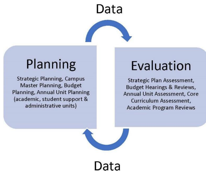
Figure 2. Data’s Role in LIT Planning & Evaluation

At LIT, planning and evaluation are ongoing processes mediated by data. Decisions from the institutional or strategic level to the unit level are grounded in data, which, as Figure 2 indicates, is an input and output of the college’s planning and evaluation activities: