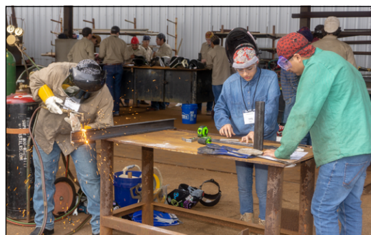
High school students compete in the SkillsUSA welding competition.