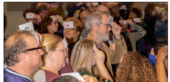
Faculty and staff participate in a team-building activity.