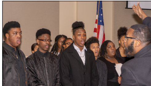
Beaumont United High School singers Voices United wowed the crowd with their amazing vocals.